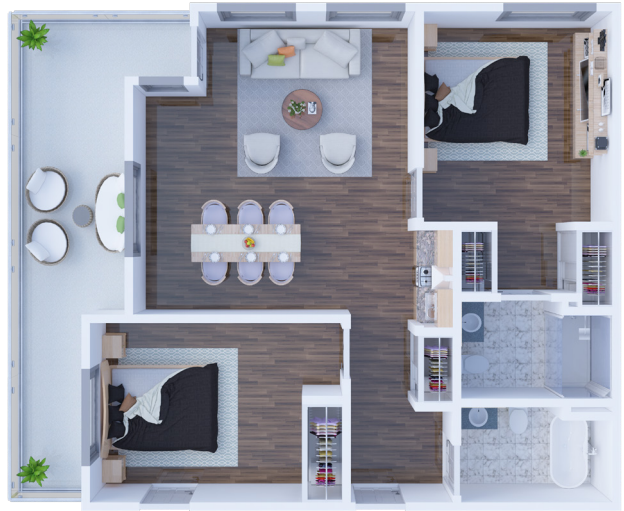
C2 Two Bedroom 937 SQ FT