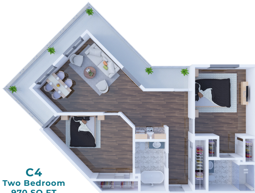
C4 Two Bedroom 970 SQ FT