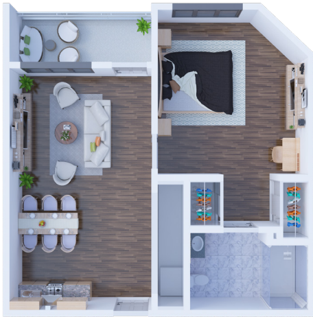
B5 One Bedroom 547 SQ FT