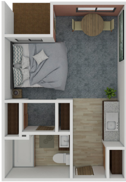
A1 Studio 396 SQ FT

Solstice Senior Living at Plano offers several floor plan choices to suit your needs.