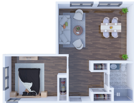
B4 One Bedroom 647 SQ FT

Solstice Senior Living at Plano 1940 W. Spring Creek Parkway, Plano, TX 75023 (855) 982-2804 SolsticeSeniorLivingPlano.com