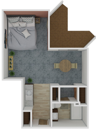
A6 Studio 527 SQ FT