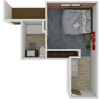
A7 Studio 341 SQ FT