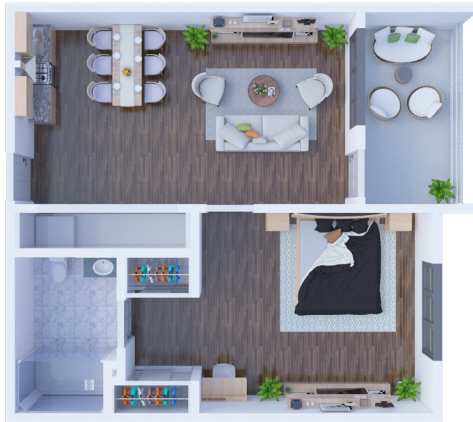
B1 One Bedroom 549 SQ FT